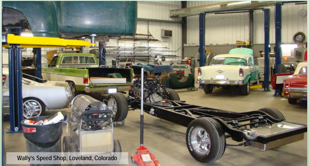
Wally's Speed Shop, Loveland, Colorado

Car Show Highlights, Auction News and More!